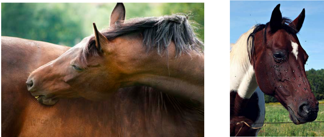
Fig.4. Horses often react violently to bites from this fly and try to shoo them with their tail or mouth or stamping of their feet as well as brushing up against fence posts and trees to remove the itch from their bites (left). Flies around a horses face (right) are invariably bush flies and not biting flies, which attack the lower limbs and underbelly.