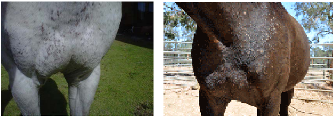
Fig.3. Photos depicting a horse's reaction to stable fly bites. The fly's bites come up in welts, which are extremely itchy and horses will often have an allergic reaction to them.