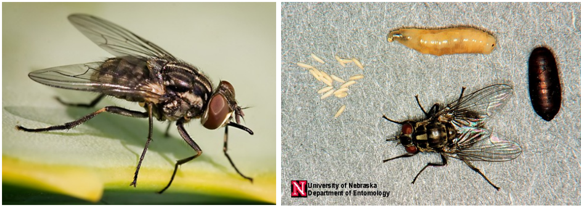
Fig. 2. An adult biting fly with prominent biting mouthpart (LHS) and all the stages of the biting flies life cycle (RHS) from egg (left) to actively feeding larvae (centre, top), dormant pupae that lie in the soil (right) and adult biting fly that emerges from the pupae and digs its way to the soil surface where it flies away in search of a blood meal.