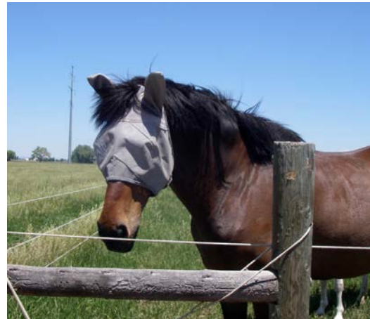
Fig.1. Horse owners have resorted to putting protective rugs, fly boots (left) and face masks (right) on their horses to reduce the numbers of biting flies affecting their animals.

The name “stable fly” is an historical name given to the fly when animals were housed over winter in the northern hemisphere. Being kept indoors for several months their straw bedding was rarely changed and the animals manure and urine mixing with the straw allowed the “stable fly” to develop in this fermenting material. The name “stable fly” suggests that this fly only comes from stables, which is simply not the case in and around Perth. Horse stables and owners rarely produce high numbers of biting flies as their manure is removed at least once daily and horse manure by itself is simply too dry for this fly to develop in, even if spread on irrigated, green pastures and watered.