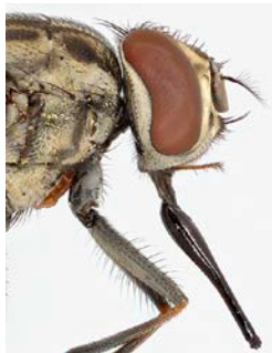
Fig. 7. Biting Fly piercing mouthpart