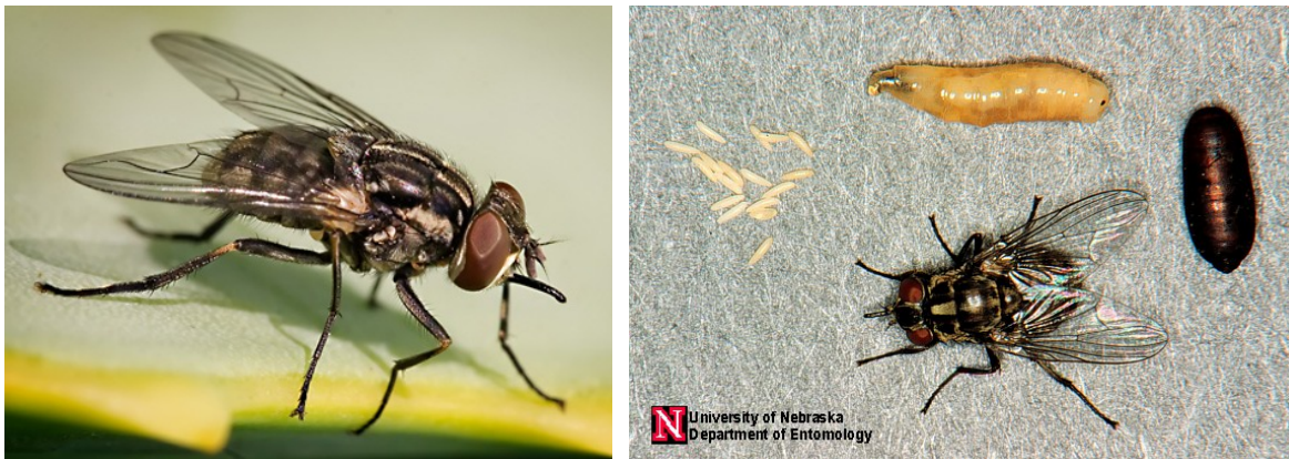
Fig.1. An adult biting fly with prominent biting mouthpart (LHS) and all the stages of the biting flies life cycle (RHS) from egg (left) to actively feeding larvae or maggot (centre, top), dormant pupae that lie in the soil (right) and adult biting fly that emerges from the pupae and digs its way to the soil surface where it flies away in search of a blood meal.

Rotting crop residues of vegetables such as cauliflower, broccoli, celery, cabbage and lettuce have been continually shown to produce extremely high numbers of biting flies if not managed properly (from 100 to >1,000 flies/m 2 of soil). Livestock producers and rural residents across many Shires around Perth continue to bear the impact of this fly.