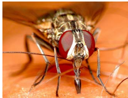
Fig 8. A Biting fly drawing blood from a human

The picture on the far left shows that the biting or stable fly is slightly smaller than a house fly but has the prominent black piercing mouthpart sticking out the front of its head – this is lowered and used to pierce the skin of animals and humans to draw blood, as is shown in Figs 7 and 8. House flies have sponge-like mouthparts that release saliva down onto a surface and then suck back up the food they have contacted (see Fig 6).