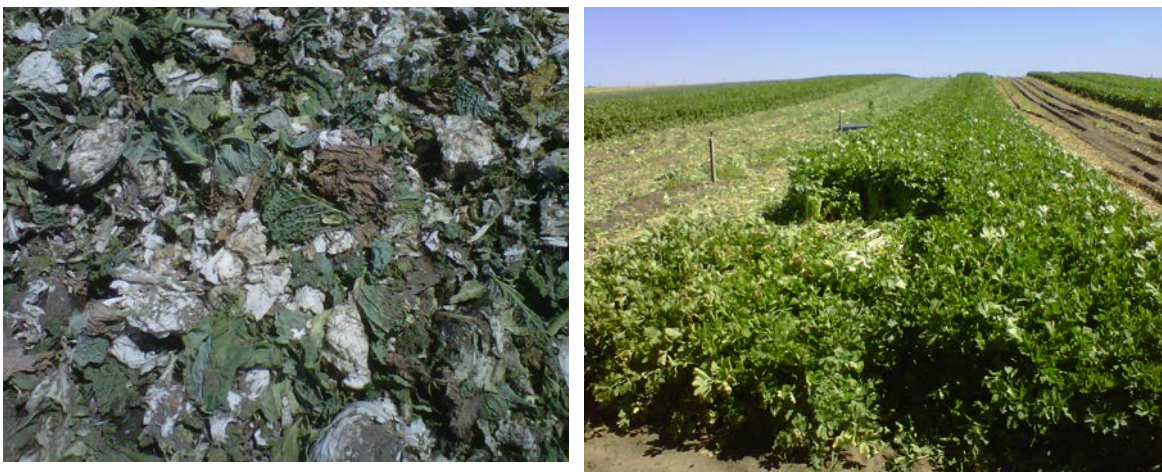
Fig.2. Rotting leaves and stalks left after harvest is complete from leafy crops such as cauliflower (LHS) and celery (RHS) allow biting flies to develop in huge numbers on sandy soils that are regularly watered overhead.