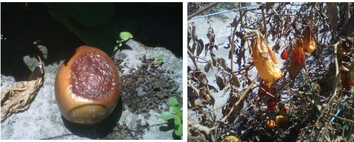
Fig.4. Reject and/or damaged produce such as eggplant (aubergine) (LHS) or abandoned crops (roma tomatoes RHS) left to rot allow the biting fly to develop from every fruit. As these crops are picked daily for several months, the reject produce must be moved into an open pit and deep buried weekly with at least 300mm of soil or the abandoned crop sprayed and left to prevent fly development until completely dry.