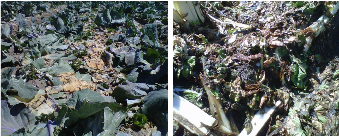
Fig.3. The huge amount of leaves and stalks and reject produce left after harvesting is complete in crop such as cabbage (left) and silverbeet (right) provide a perfect breeding ground for biting flies. Proper management of this material can significantly reduce the numbers of biting flies that are capable of developing (see below).

Reject and/or damaged produce of vegetables such as eggplant, cauliflower, lettuce, cabbage, bell peppers, pumpkin, zucchini, beetroot, chinese radish, potato, spring onion, tomato and celery, left to rot on the ground allow for significant numbers of biting flies to develop. Where possible, every piece of reject produce needs to be either removed and placed into a deep pit before being covered with 300mm of sand every 3-4 days and/or sprayed if it is impractical and too costly to pick up this reject produce.